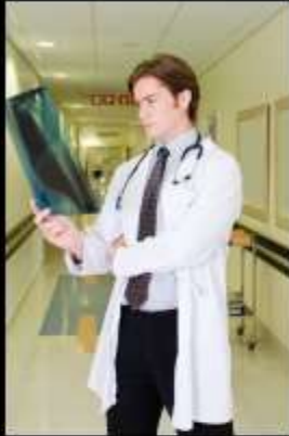
what my family thinks I do