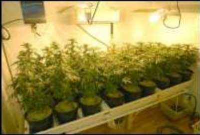
what my friends think I do