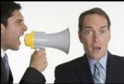
what doctors think I do