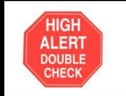
what I really do