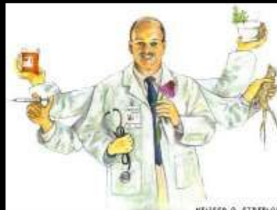
what I think I do